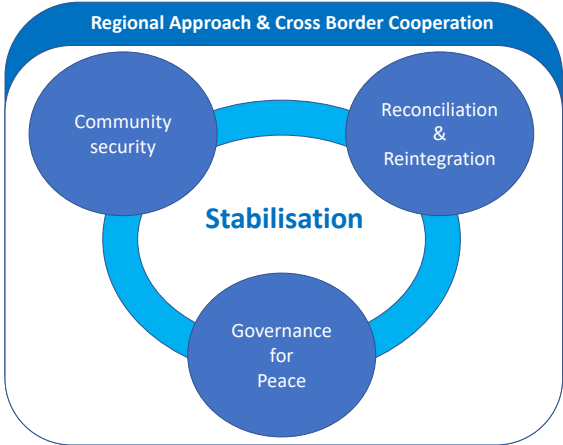
Figure 1: Overall Approach to Stabilisation

87. To lay the foundations for longer-term peacebuilding, recovery and development activities, the programme in Phase II will continue to implement immediate stabilisation measures initiated in Phase I in the selected border communities aiming at: improving community security, rebuilding local administrative and governance structures and strengthen their ability to deliver, and supporting the process of reconciliation and reintegration with former associates of Boko Haram and CJTF members and vigilantes.